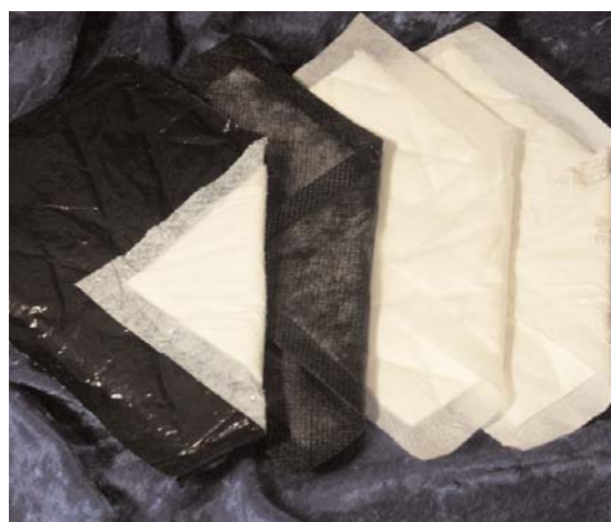
↑ Standard Pad ↑ Multi-Loc® Pad ↑ Multi-Loc® Pad ↑ Standard Pad

Inquire about other colors, sizes, and absorbencies.